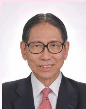
Dr. LEONG Che-hung, GBM, GBS, OBE, JP Patron, Hong Kong Academy of Nursing & Midwifery