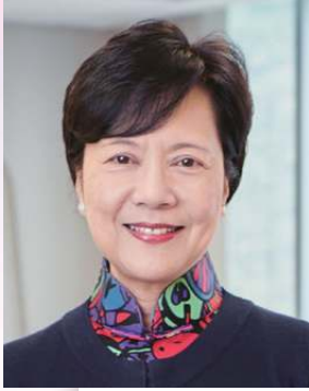
Prof. TIWARI Fung-ye, Agnes Chairman, Nursing Council of Hong Kong

As the Chairman of the Nursing Council of Hong Kong, I am honored to extend heartfelt congratulations to all of you on the auspicious occasion of International Nurses Day 2024. This year's theme, "Our Nurses. Our Future. The Economic Power of Care," highlights the invaluable role of nurses not only in healthcare but also in shaping economic well-being.